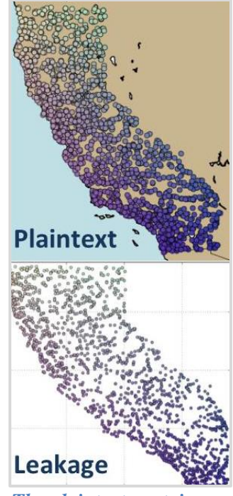
The plaintext contains locations of California road intersections